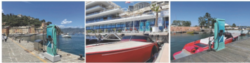
Figure 1: Our 75 kW RTM75 model deployed at the Monaco Yacht Club, Portofino Yacht Marina and in Venice, for electric boat charging